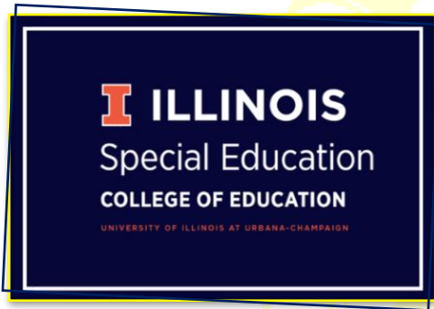
2019- Special Education Department of the University of IL, Urbana-Champaign

The Margaret Bancroft Distinguished Leadership Award is the highest honor the Winston Knolls Foundation bestows upon an outstanding individual or organization celebrating the accomplishments of this exceptional individual or organization whose professional achievements, personal life, public or civic service, philanthropic or volunteer endeavors reflect their dedication and meritorious accomplishments. Past recipients of these awards include: